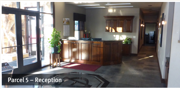
Parcel 5 – Reception