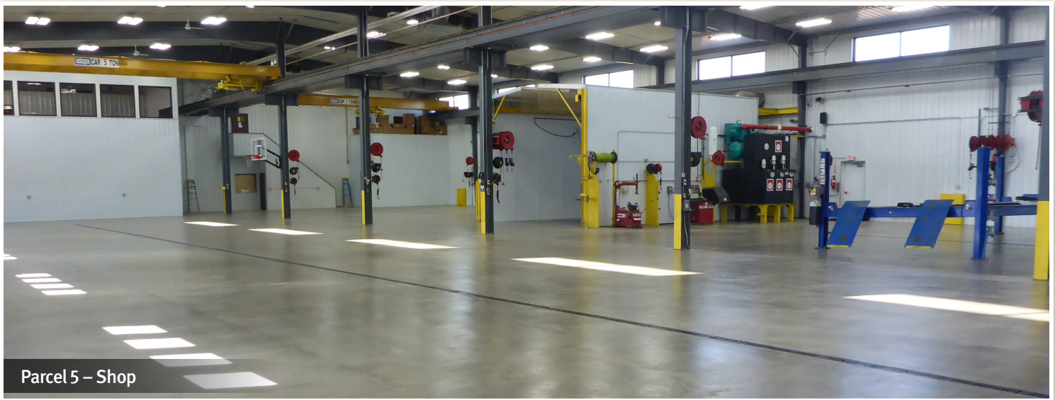
Parcel 5 – Shop