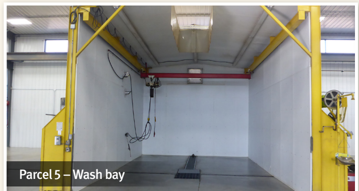
Parcel 5 – Wash bay