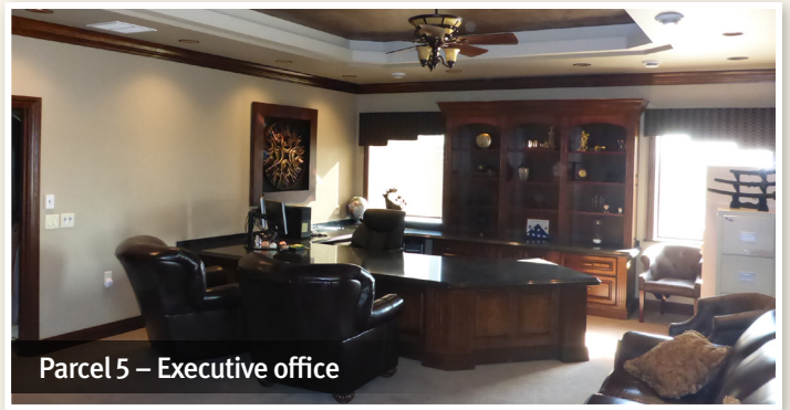
Parcel 5 – Executive office