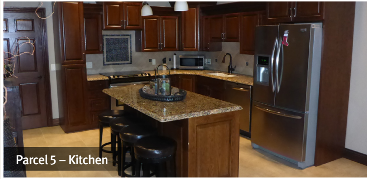
Parcel 5 – Kitchen