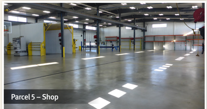
Parcel 5 – Shop

Bidders must satisfy themselves as to the exact current acres, property lines and fence locations, building sizes, taxes and assessments, zoning and permitted uses & surface lease revenue details. The information provided is a guide only.